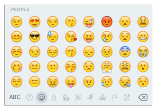
Figure 5. Emoji Keyboard

For Spanish tests, the emoji keyboard will need to be enabled because of its connection to accented characters.